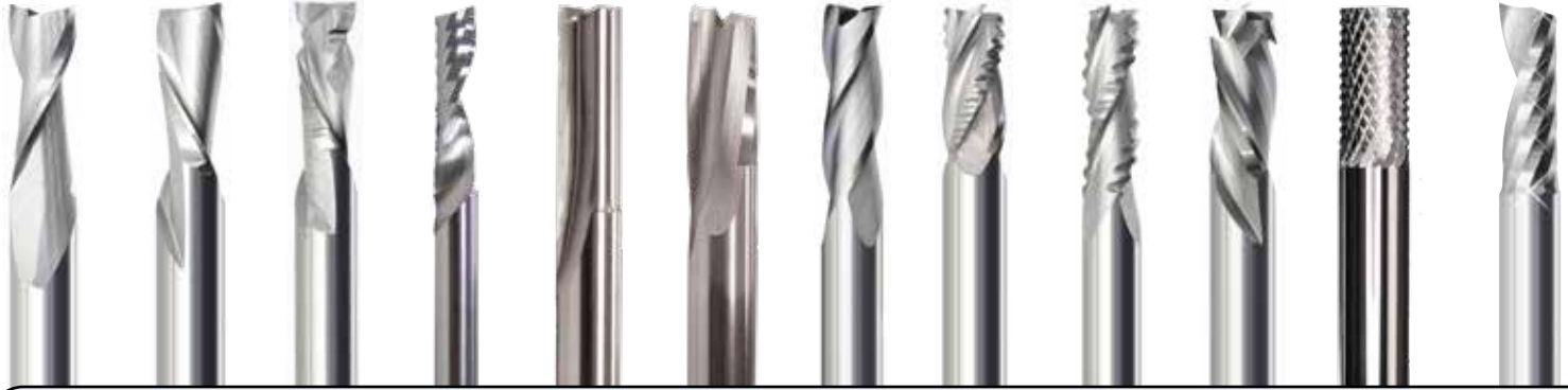
Upcut Routers Downcut Routers Compression Routers 1 Flute "O" Flute Straight Flute Slow Spiral 3 & 4 Flute Routers Combination Spiral Rippers Mortise Compression Fiberglass Routers OFX "O" Flute Extreme