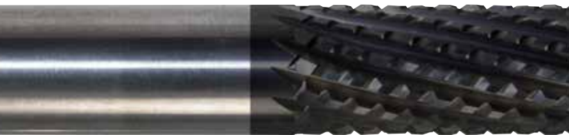
Fine Pitched Nicked