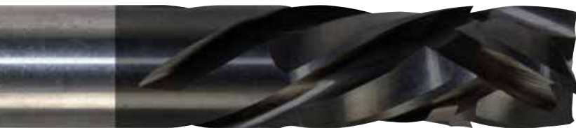
Herringbone Composite Surface Finisher