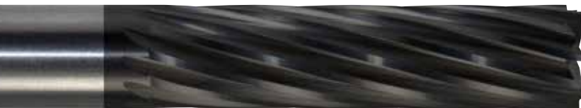
Composite Rougher Semi-Finisher